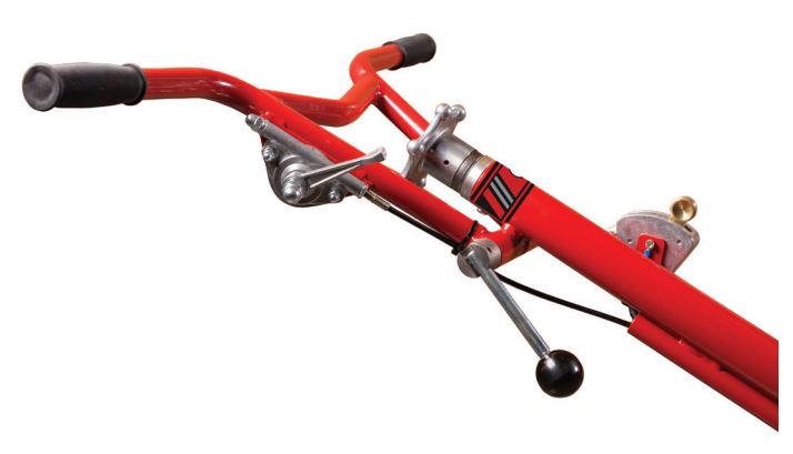
Fine pitch handles use a twist action to control blade pitch from flat to 28° and anything in between.